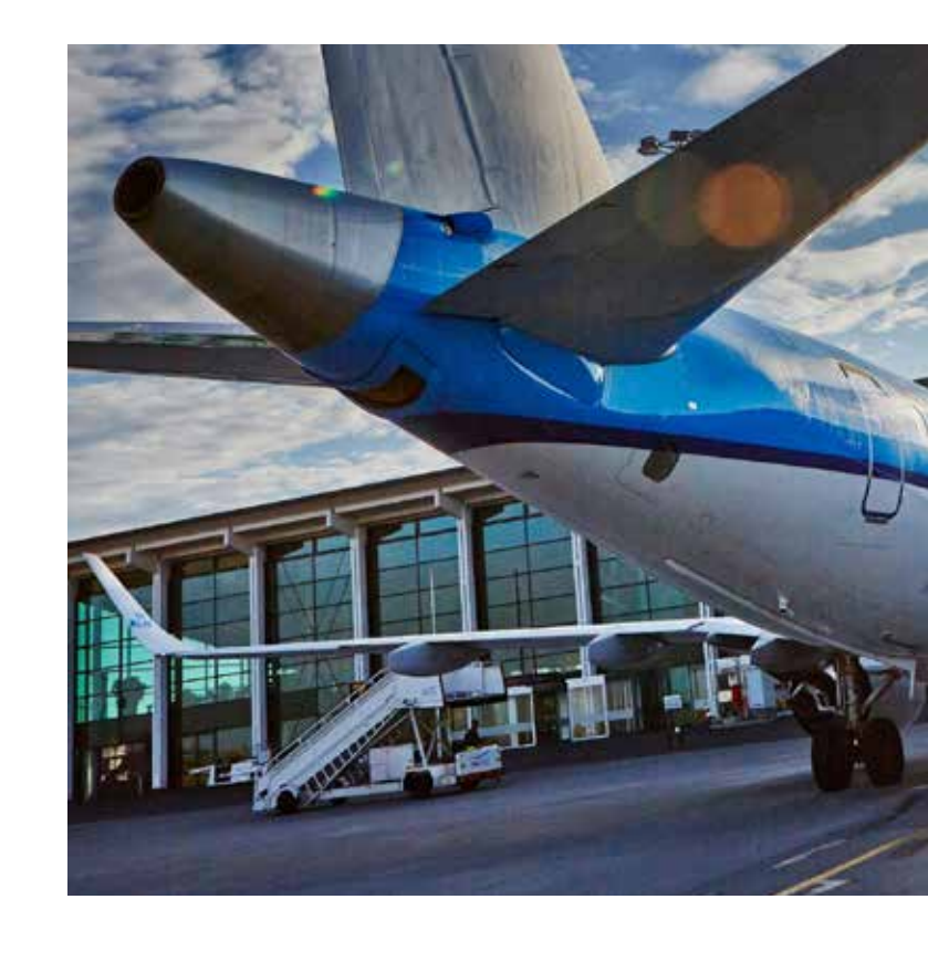
Aalborg Airport Several airlines operate flights to Aalborg Airport.

Of course, Frederikshavn can also be reached by train.